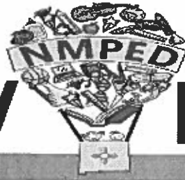
EXHIBIT A (24154 - PLANNING FY22-23)